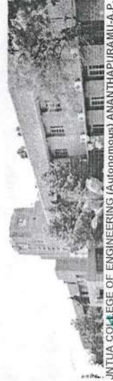
JNTUA COLLEGE OF ENGINEERING (Autonomous) ANANTHAPURAMU-A.P. University College of Engineering & Technology, Bikaner Technical University, Bikaner, Rajasthan