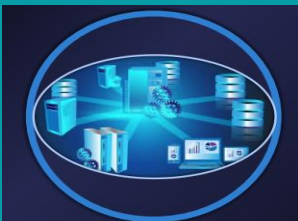
Data Base Management Systems