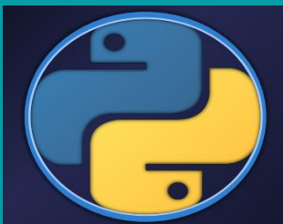
Introduction to Python