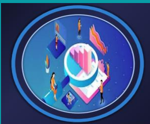
Data Analysis with Python