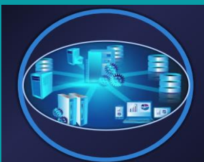
NoSQL Data Base System