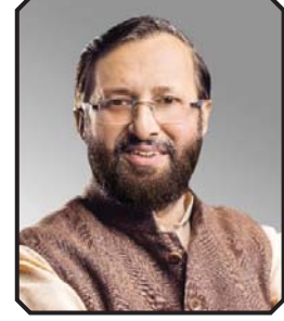
Prakash Javadekar Minister of Human Resource Development Government of India

Government of India Ministry of Human Resource Development