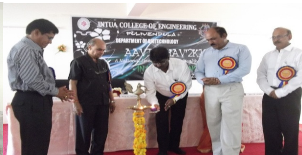
Dignitaries during Lighting the lamp