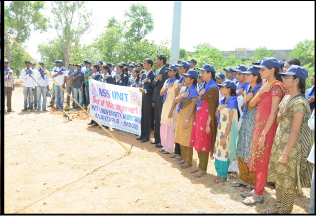
Students of JNTUA taking NSS Pledge