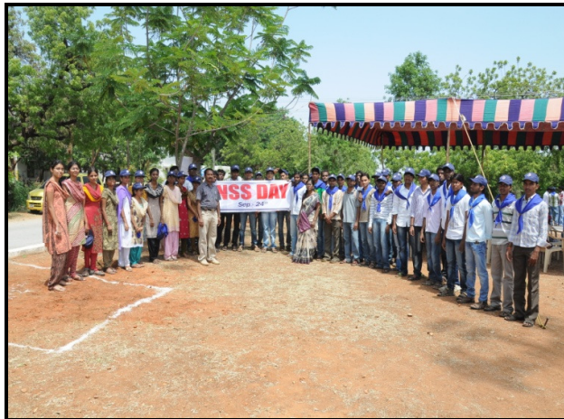
Students of JNTUACEA with Program Officers at rally