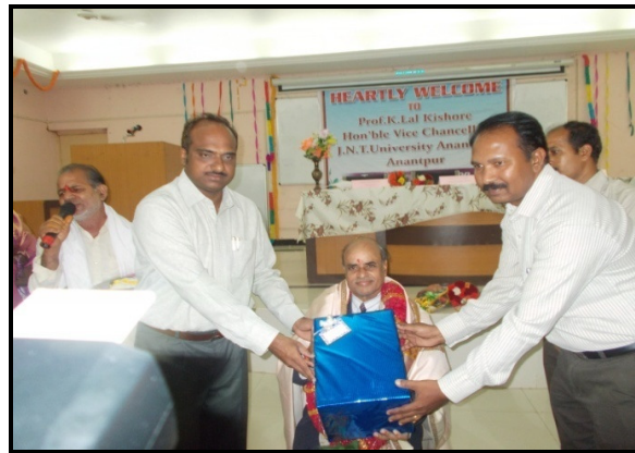
Felicitations to VC by President and Secretary