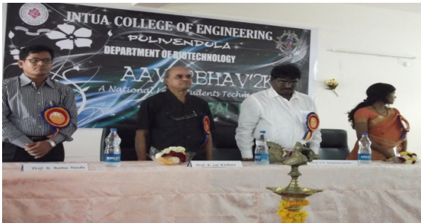
Hon'ble V.C. gracing Inaugural function

Different sessions of oral presentations and Poster Presentations were organized as a part of the Symposium. Several students from various Institutions attended the symposium.