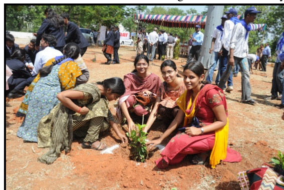
Students of JNTUACEA at plantation site