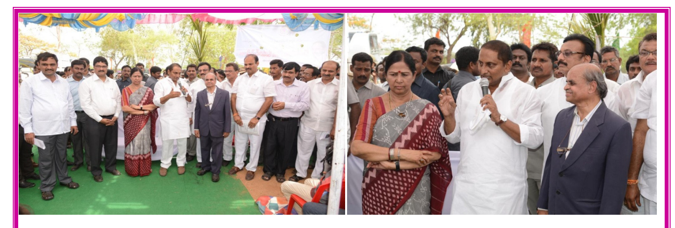
Chief Minister, Vice-chancellor, Ministers, MP, Rector, Registrar and other dignitaries on the occasion