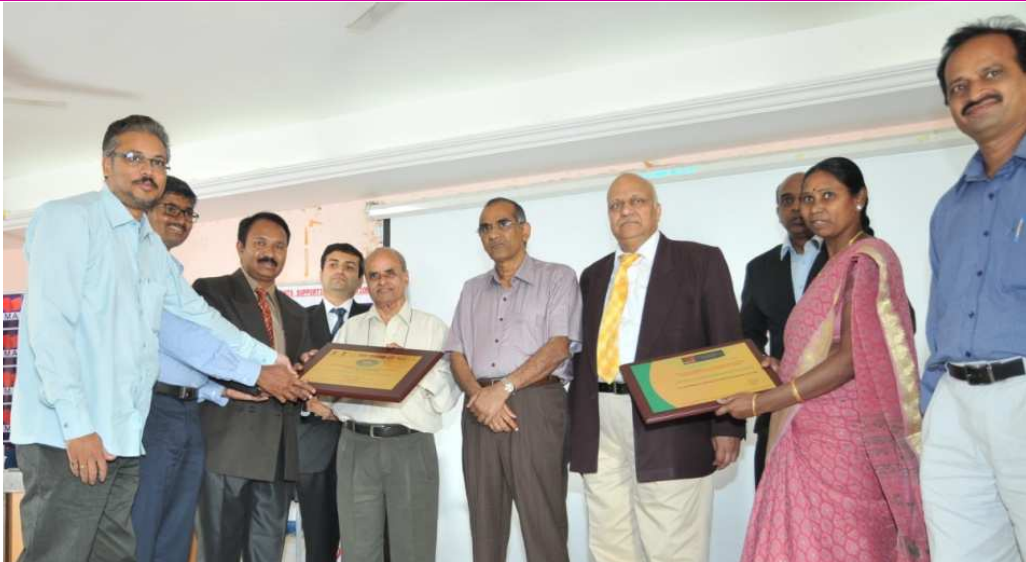
National Andhra Pradesh Education Summit Awards Presentation