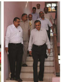
UPSC Chairman Visiting JNTUCEA