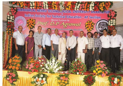
ISTE AP Section Management Committee members with UPSC Chairman & Member